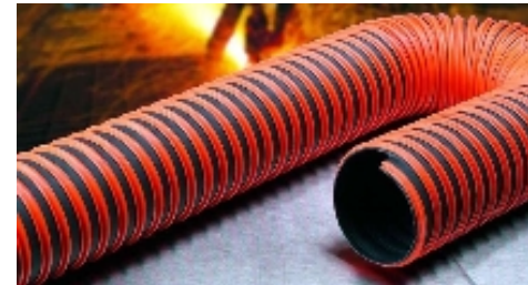
Click Here to Enlarge Picture

March 7, 2005 - Used to solve fume control issues in hazardous environments where high heat, sparks, and slag are commonplace, Flame Retardant Fume Control Duct (SF-TPR-FR) features TPR construction for flexibility and use in cramped, limited spaces with tight corners. Product, made with UL 94VO-approved material, has operating temperature range of -40 to +300°F and is available with or without encapsulated wire. Sizes range from 3/4–24 in. with lengths of 25 and 50 ft.